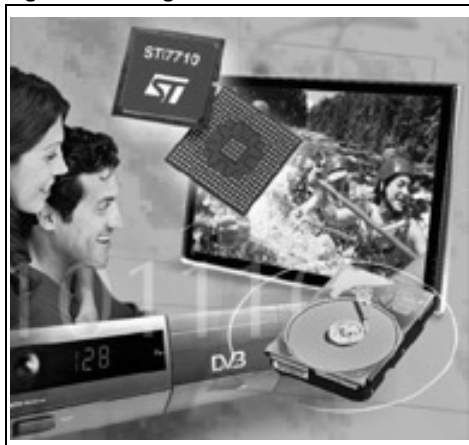
Figure 1. Package